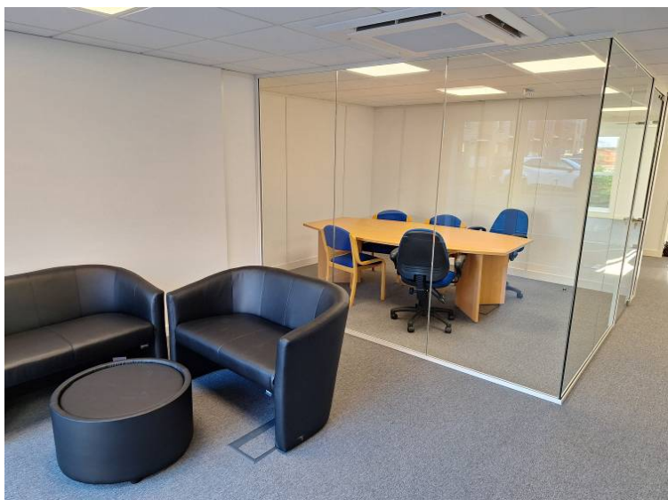
Shared use of reception and meeting room.