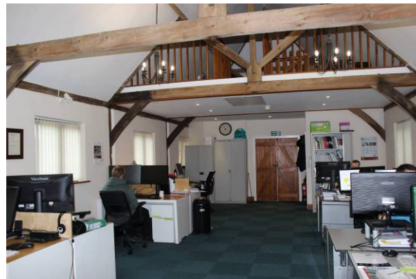
Internal photo showing the office in 2016 before the current use.