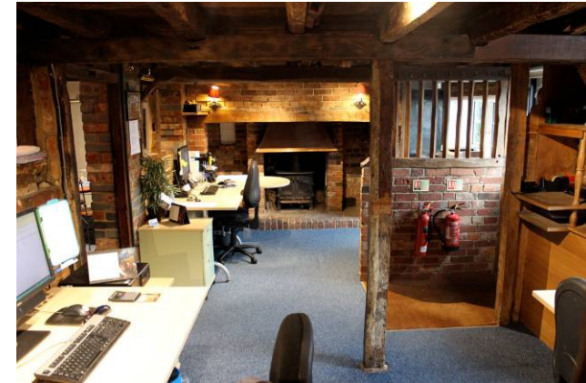
Ground Floor Office

Each party to be responsible for their own legal costs.