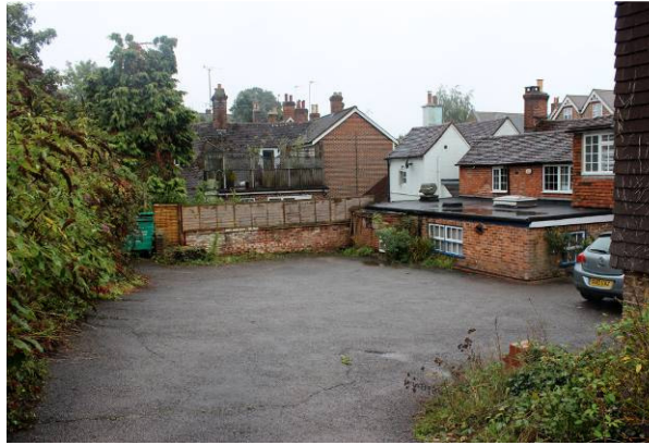
Rear Car Park