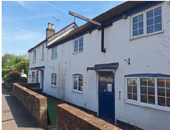
Ground Floor Rear

Colyer Commercial has not checked and do not take any responsibility for any of the services within this property and would recommend that any incoming occupier satisfies themselves in this regard. These particulars and the descriptions and measurements contained herein do not form part of any contract and whilst every effort has been made to ensure accuracy, this cannot be guaranteed. All figures quoted are exclusive of VAT if applicable.