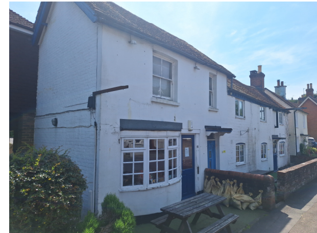
No 85 – Retail Unit